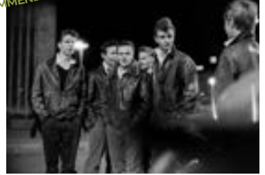
Kuvassa Steissin kingit Rautatieasemalla 1978.